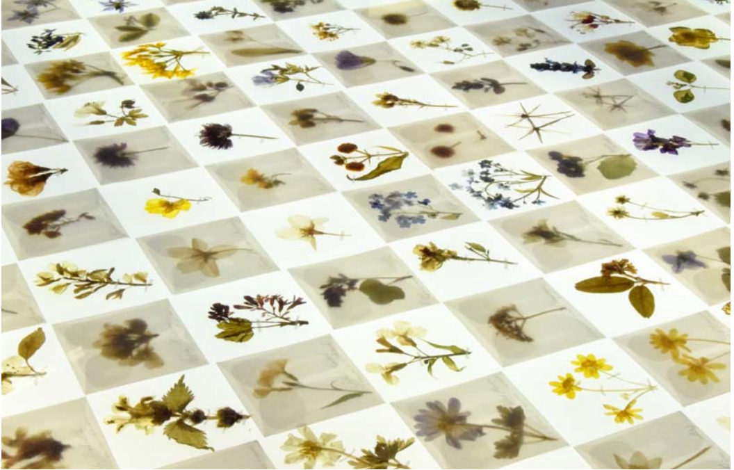
Princesshay Honey Flow (detail) by Amy Shelton (2016). (Pressed botanical samples, herbarium linen tape, glassine envelopes, graphite, lightbox)

The Princesshay Honey Flow light box by Amy Shelton is a bespoke, specially commissioned public artwork installed in Princesshay, Exeter, illuminating the melliferous (honey yielding) floral sources across the seasons which are vital for honeybees to sustain their colonies. The artwork is created from all of the most important bee plants visited by pollinators